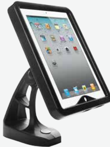
TABLE TOP MOUNT Product: 8.5" x 7.3" x 11.7" Base: 5.8" x 3.5" x 7.3" Weight: 2.3 lbs