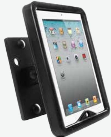
WALL MOUNT Product: 8.5" x 6" x 10.5" Base: 3.5" x 2.5" x 7.7" Weight: 2.8 lbs