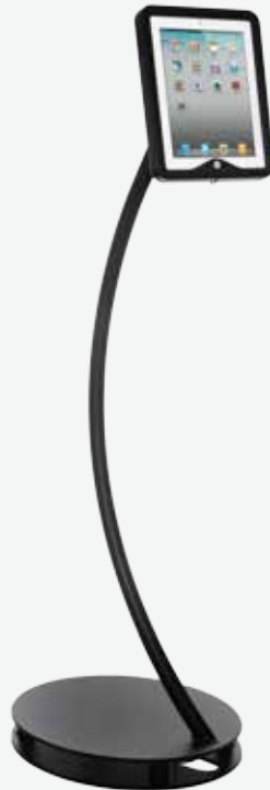
FLOOR KIOSK Product: 14" x 18" x 48.13" Weight: 31.5 lbs