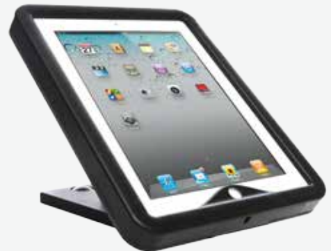
SECURE FLIP Product: 8.5" x 10.5" x 7.6" Base: 3.5" x 2.5" x 7.7" Weight: 2.8 lbs